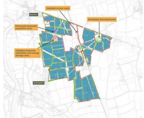
Figure 1: An illustrative summary of the updated proposals for West Burton 3

An application for a Development Consent Order is anticipated Q1 2023 (PINS have yet to give notification of an expected date).