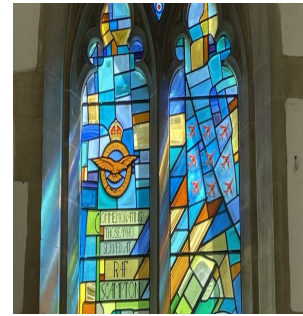
ton's future—Watch this Space!

A stained glass window commemorating the RAF's link with Scampton was dedicated in the church & another window to mark the 890th anniversary of the Dambuster's is due to be installed in 2023. Of Scamp-